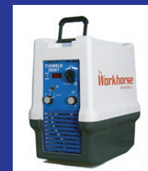
Workhorse 300ST ArcStarter TIG