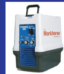
Workhorse 300S Stick/Lift Start TIG