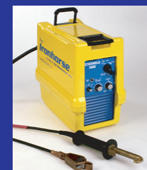
Ironhorse 300S 700V DC Input