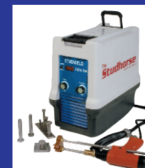
Studhorse 1000DM & 1200DM Stud Welders