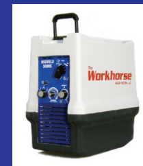
Workhorse 300MS MIGweld