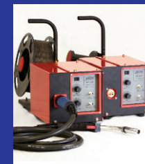
Wire Feeders WF200R and WF400R