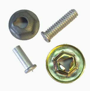
Weld Studs & Speed Nuts