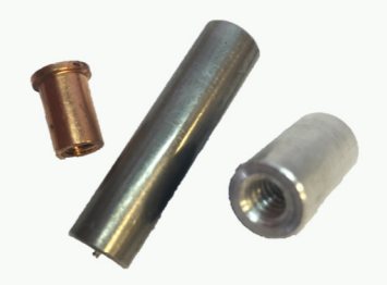
Female Thread CD Weld Studs